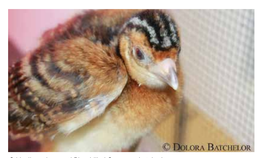
Critically endangered Blue-billed Curassow hatched.