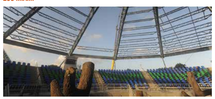
Completed Sami Family Amphitheater canopy construction project