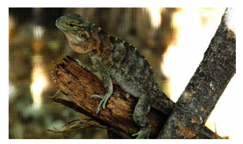
Critically endangered Jamaican Island Iguanas hatched.