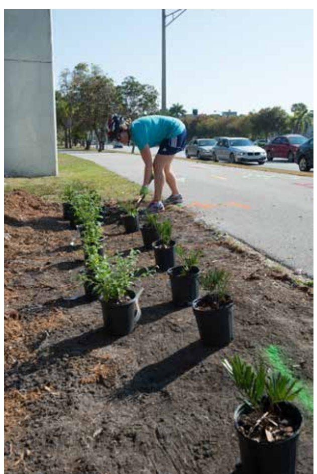
The Underline partnered with Miami-Dade Transit and Friends of The Underline to select New York design consulting firm James Corner Field Operations as the firm to develop the vision and Master Plan for The Underline, the 10-mile linear park underneath the Metrorail line.